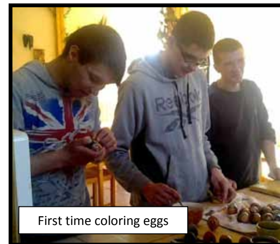
First time coloring eggs